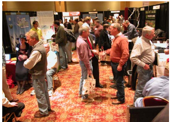
The aisles were crowded during breaks in presentations.