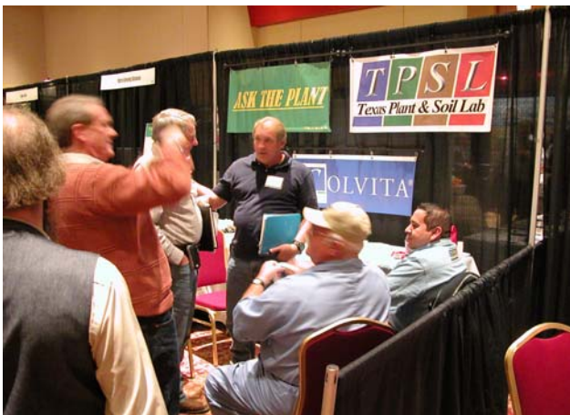
Our booth got very crowded at times.

A particularly nice aspect of the event was that we didn't have to drive back through a blizzard, as we did in 2010 from Indianapolis.