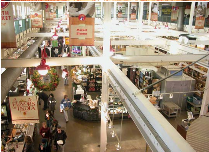
North Market – From the mezzanine.

The sit-down eating area is on all four sides and you can look down into the central market area.