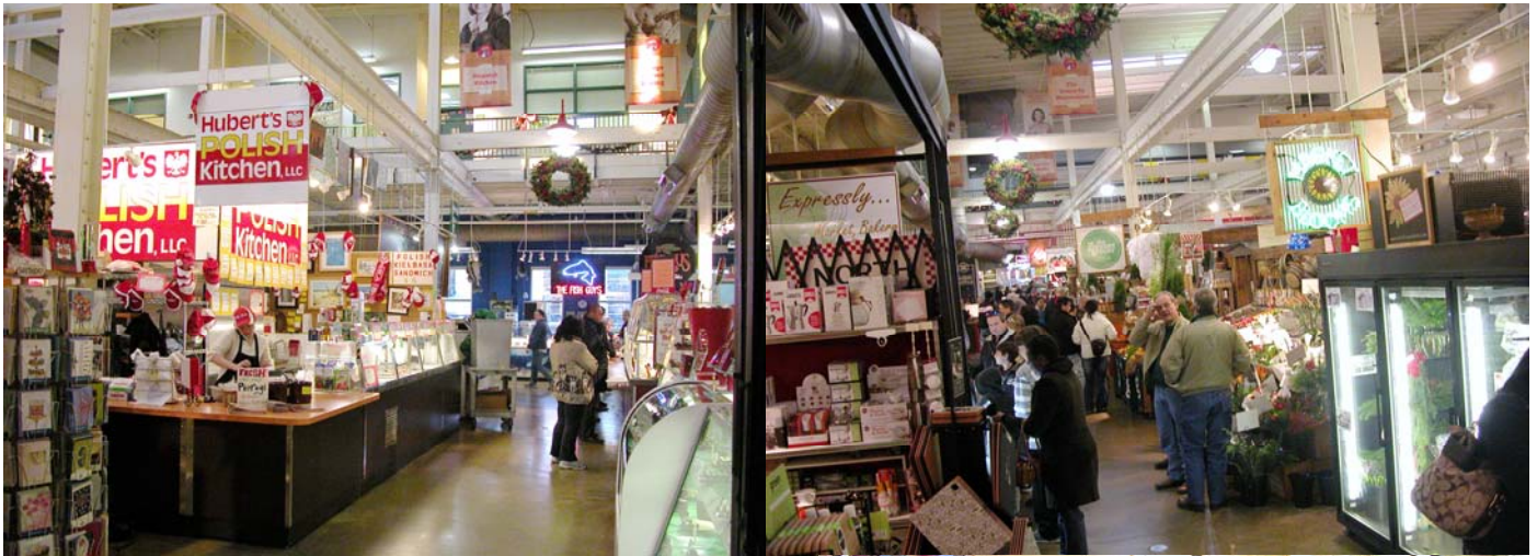
The main floor...